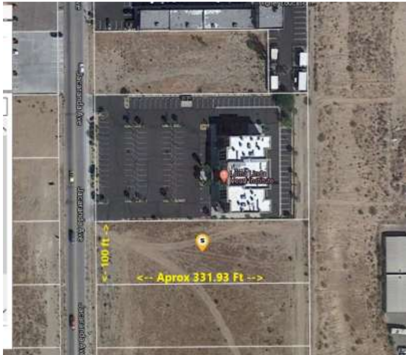
Aerial Of Lot